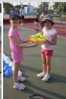
September School Holiday Clinic