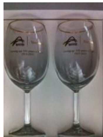
Centenary Wine Glass