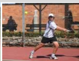
Junior Development Series 'A' Circuit- 28 + 29 May