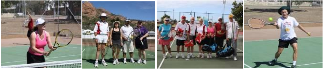
Vets Tennis Tournament