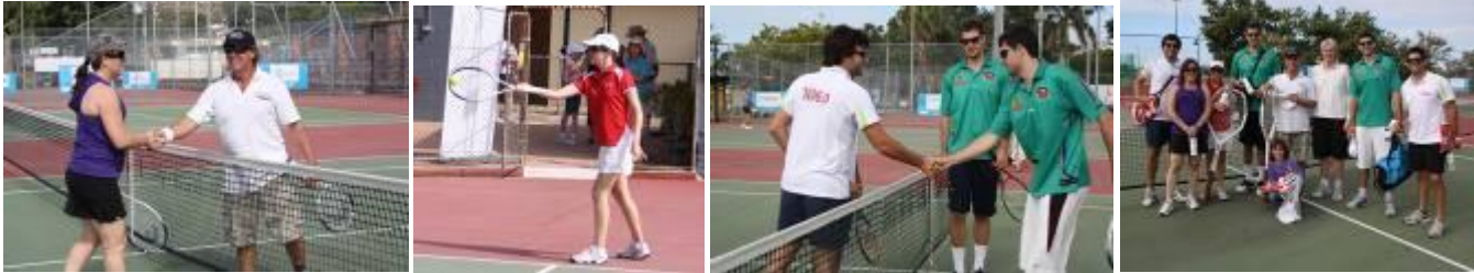
Celebrity Tennis Tournament