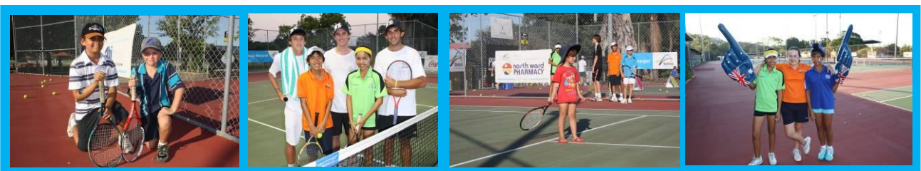
Road to the Davis Cup

Our dedicated office and coaching staff again did an excellent job maintaining financial records, organising fixtures and tournaments, coaching juniors and adults, and performing a multitude of other tasks.